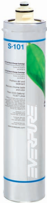
S-101 Cartridge: EV9273-77

Delivers premium quality RO water for drinking water applications